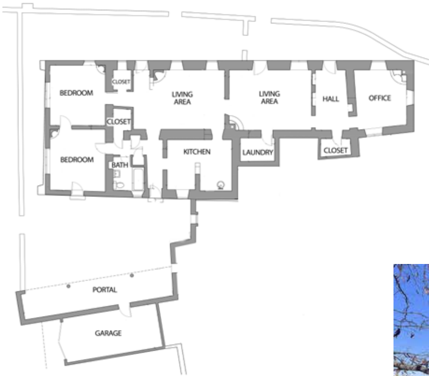
424 ACEQUIA MADRE UNIT 16 - FLOOR PLAN This depiction is for illustration purposes and may not be entirely accurate