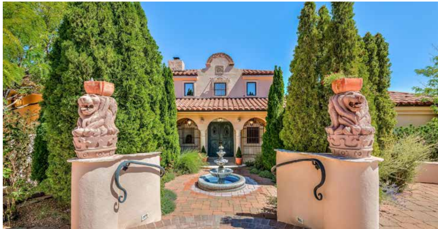
101 TANO NORTE PLAT

3 Bedroom / 4 Bath / 5870 SF • $3,500,000 • MLS# 201804576